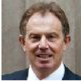
Tony Blair United Kingdom Prime Minister